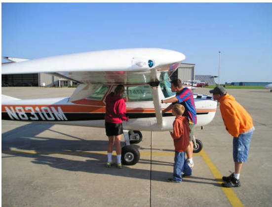
C-150 Aerobat share for sale Rick Hixson