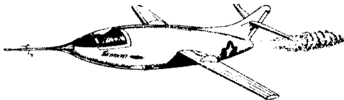
DOUGLAS D-558-2 "SKYROCKET" First version of the airplane which flew twice the speed of sound.